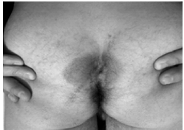
Figure-1. Clinical view of the patient.

CT of the patient showed the transverse fracture of the 4 th sacral vertebrae (Figure-3). Patient was treated with analgesic/anti-inflammatory medicine together with topical epithelization treatment for the superficial lacerations in the sacral region. Patient was given 4 weeks of bed rest, limitation of activity and analgesic treatment and followed up.