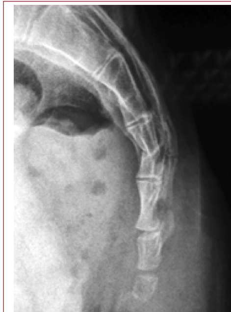
Figure-2. Suspicious fracture at the S4 vertebra.