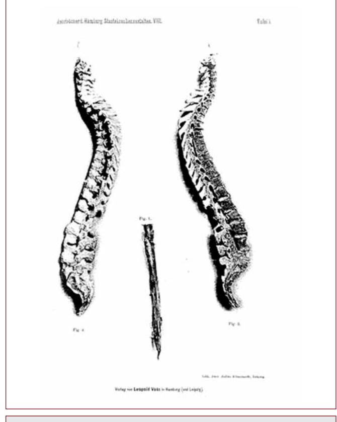
Figure-4. Figures from Mr. Orhan Abdi's thesis.

According to the patient's records, treatment was begun after the diagnosis of iatrogenic fractures in the first and second vertebrae with cauda equina compression. There was no apparent correction with conservative treatment, and so he received laminectomy and decompression surgery with chloroform anesthesia on 28 January (Figure-4).