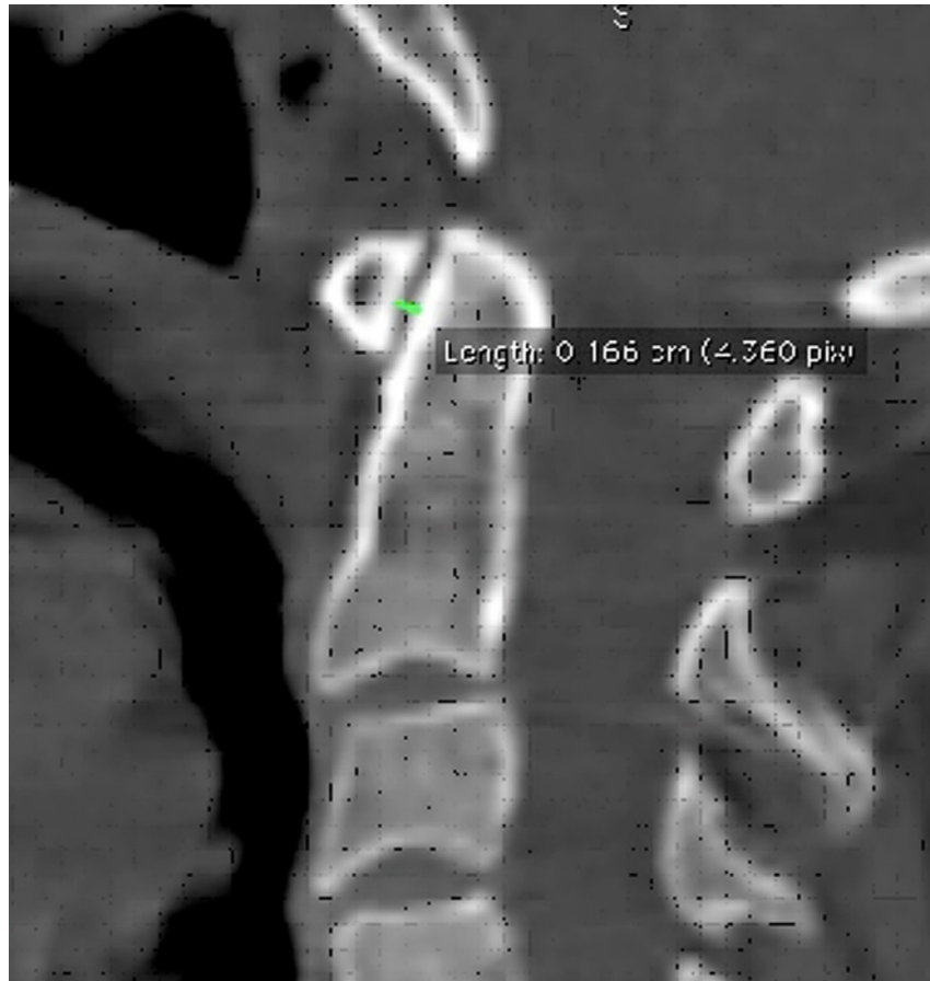
Figure-1. Measurement of the atlantodental distance in cervical CT sagittal images