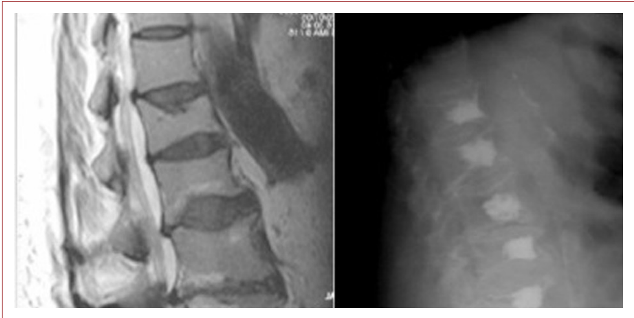
Figure-4. Sagittal T2-weighted MRI of lumbar vertebrae showing acute L1–5 and chronic T12 osteoporotic vertebral compression fractures. Vertebroplasty for acute fractures with prophylactic vertebroplasty at the L2, L3, and L4 levels, and kyphoplasty for the chronic compression fracture at the T12 level were carried out.

The general health condition and age of the patient, the trauma type, the time between trauma and surgery, and the experience of the surgeon, all significantly affect the success rate of treatment 20,39 .