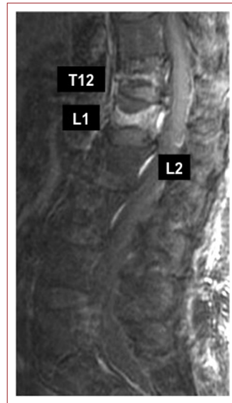
Figure-2. Acute T12–L1 and chronic L2 osteoporotic vertebral compression fractures are shown in the same MRI. In acute fractures, there is typically abnormal contrast enhancement seen on T1-weighted scans with fat saturation.

classification, defined by Magerl, are the most commonly used classifications today 12,17,30 .