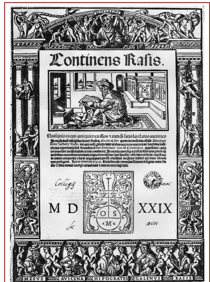
Figure-2. Liber Continens , published by Ottaviano Scotus in Venice in 1529 (25) .

One other noteworthy medical work of Rhazes was Kitāb al-Manşūrī fī al-Ṭibb that was dedicated to Khorassan governor Manşūr ibn Işhāq (4,8,36,41) . It was translated into Latin by Gerard of Cremona under the name Liber medicinalis ad Almansorem (10-11) and was first published in Milan, 1481 (36) . Rhazes created Liber Almonserem as a short compilation largely based on Greek medicine (10) containing only 10 topics over the most important medical issues of the time (10,36,38) . The seventh ( On Surgery ) (11,24) and the ninth ( On the Treatment of All Diseases , known also as Nonus Almansoris ) sections of Liber Almansorem are the most valuable sections of this work (10-11,36,41) .