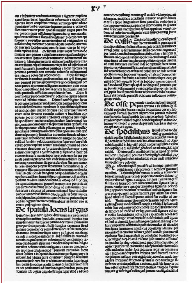
Figure-4. The page showing same quotations from Paul of Aegina in Liber Continens (30).