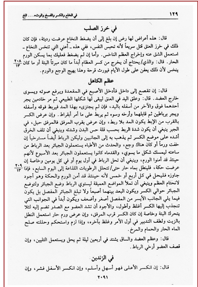
Figure-3. The page showing quotations from Paul of Aegina on fractures of the vertebra and the sacrum in Kitāb al-Hāwī fī al-Tibb (1).

when a bony fragment penetrates medulla spinalis this should be removed and if medulla spinalis is not involved anti-edema therapy is sufficient. He also described a correction method in the case of sacrum fracture (Figure-3 and 4):