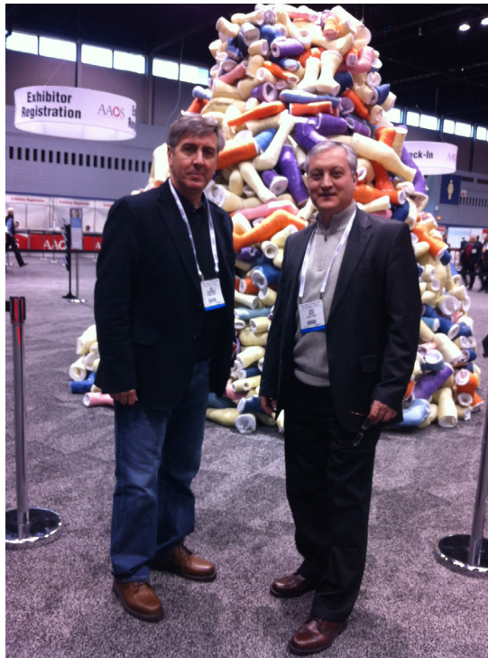
Figure-3. AAOS Meeting in Chicago in 2011.