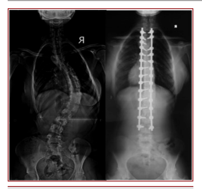
Figure-2. Preoperative and last follow up anteroposterior x-rays of 17 years old female patient with satisfying coronal curve correction

as type 1 21 patients (%26,5);type 2 4 patients (%5);type 3 28 patients (%35) Lenke type 5 26 patients (%32,5) and 1 patient had type 6 curve pattern. Most upper instrumented vertebra was T2 and most lower instrumented vertebra was L5. The mean fused levels were 11,3 (7-13). The longest fusion site was between T2 and L4.