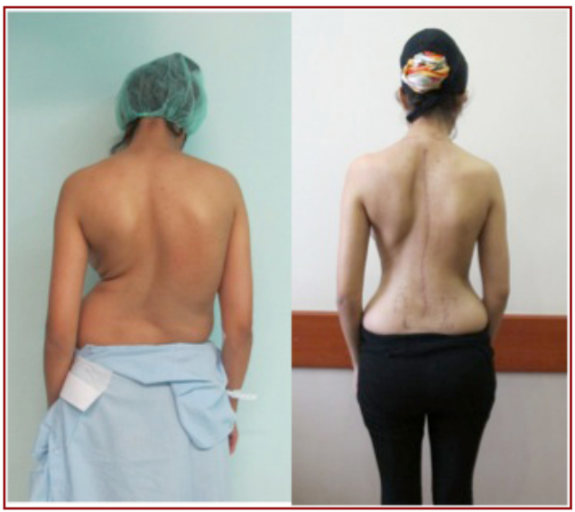
Figure-4. Preoperative and follow up clinical photographs with satisfying clinical appearance

as type 1 21 patients (%26,5);type 2 4 patients (%5);type 3 28 patients (%35) Lenke type 5 26 patients (%32,5) and 1 patient had type 6 curve pattern. Most upper instrumented vertebra was T2 and most lower instrumented vertebra was L5. The mean fused levels were 11,3 (7-13). The longest fusion site was between T2 and L4.