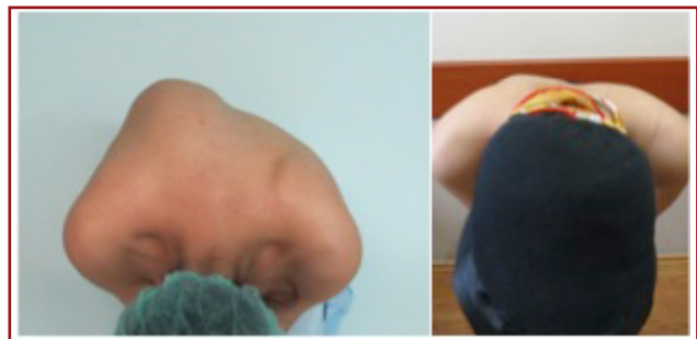
Figure-5. Rib Hump correction without thoracoplasty of same patient.

Between 2003 and 2011, 253 patients had been operated using GD technique. 80 of 253 patients who met inclusion criteria's was included to our study. 71(89 %) female and 9 (11%) male patients enrolled to study. At the surgery time mean age was 15,1 (12 yo to 21 yo). Mean age was 14,7 yo (12 to 21yo) in females; 16,8 yo (13 yo -21 yo) in males. Mean follow up time was 19,8 months (7-37 months). Deformity classification was performed according to Lenke Classification. Subgroups were