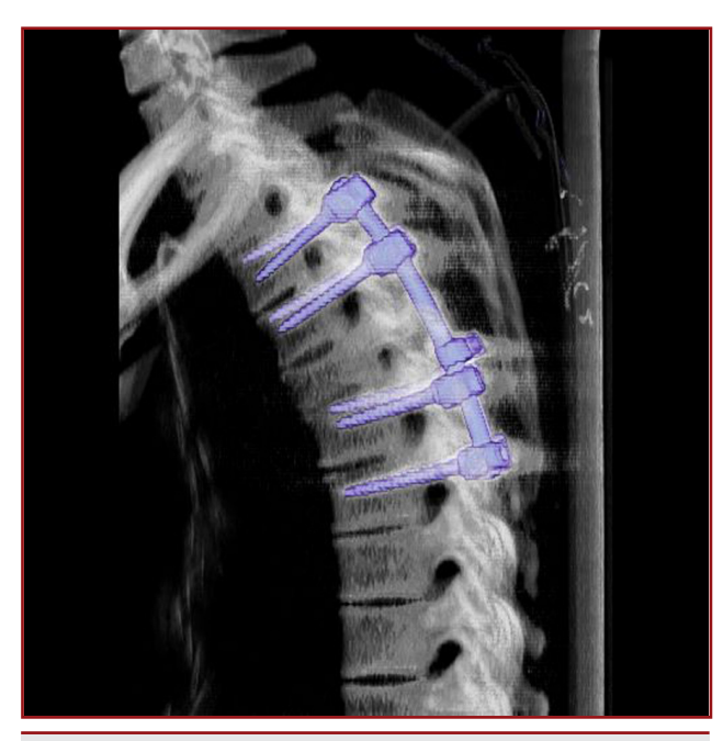
Figure-3. Postoperative T5 fracture stabilization sagittal 3D CT image