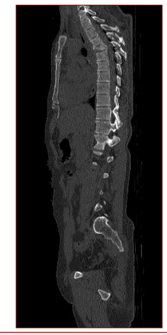
Figure-2. Preoperative T5 fracture sagittal CT image